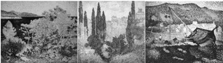
Figure 16.1 Examples of paintings and artists used by Kornell and colleagues (Kornell & Bjork, 2008; Kornell et al., 2010)

More than that, they are better at identifying new paintings from those artists and telling apart studied from not studied artists.